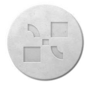
Technical and coordination