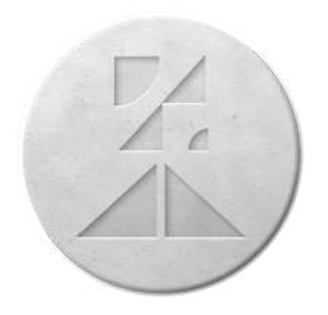
Physical and fitness